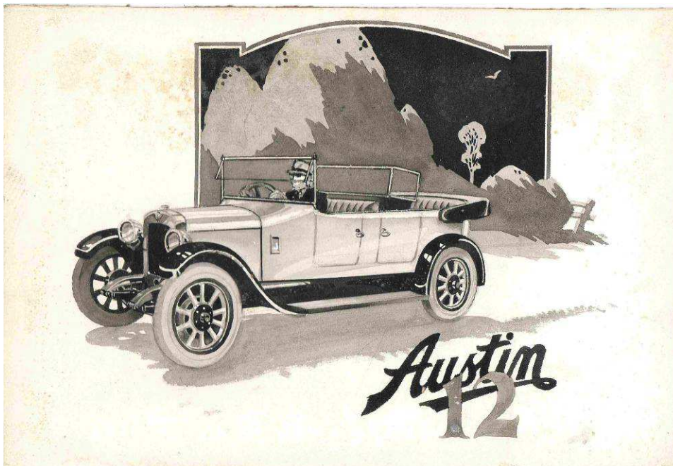
Austin 12 original gouache illustration

A small archive of the works of Cyril Freese appeared in a Norfolk auction in 2010. It would appear that he was a commercial illustrator specialising in transport topics. Besides various pieces of original art there were printed examples of artwork from BECLAWAT (Becket, Laycock & Watkinson Ltd) and editorial artwork from Motor Commerce for June 1927.