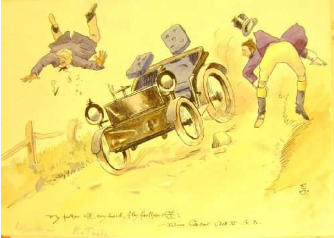
Fly further off my Lord, fly further off. Original watercolour courtesy of Clevedon Salerooms