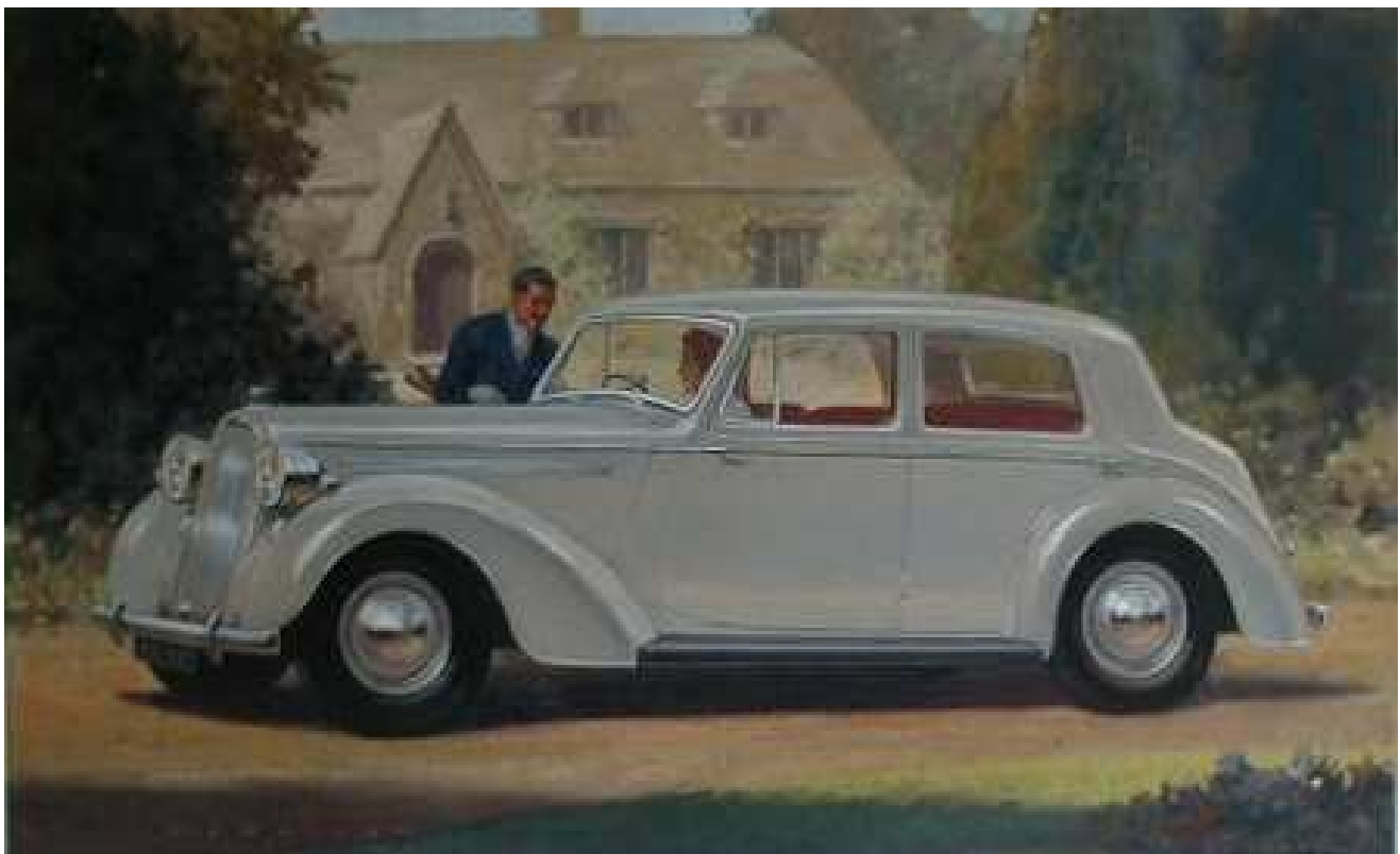
Humber saloon sales illustration