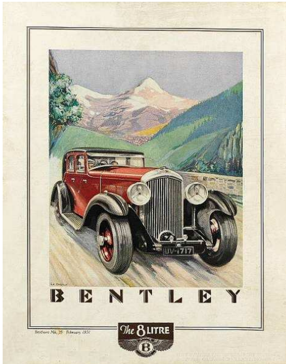
Bentley 8 litre sales brochure 1931

Cover art for this Bentley 8 litre sales brochure and also advertising artwork for Rover cars see The Autocar magazine front cover 16 th April 1926. Still working in the 1960's for Duple coachworks brochures. Assume he is a UK artist despite the French name