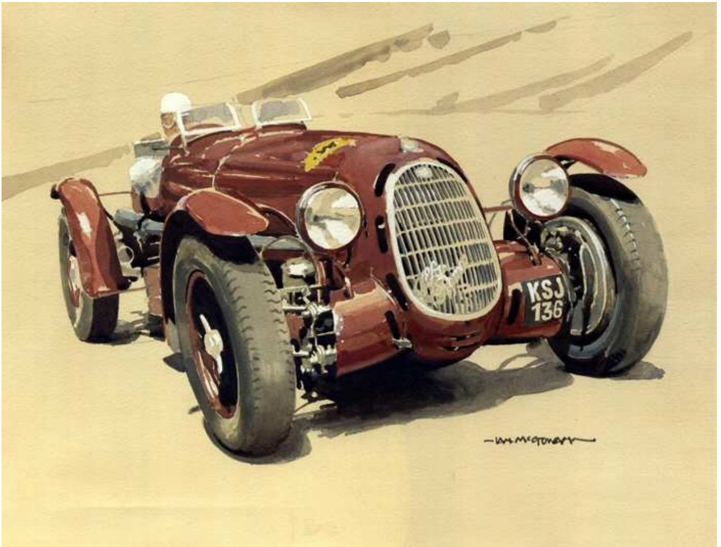
ALFA ROMEO 8C

Here are the biography and details supplied by the artist:-