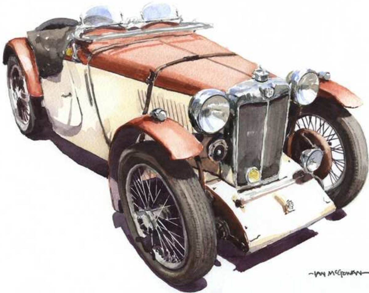
MG PA CREAM CRACKER TEAM