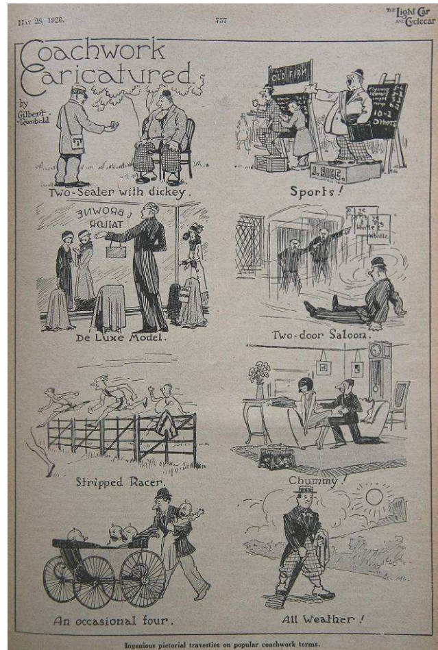
Artwork from The Light Car and Cyclecar in 1926