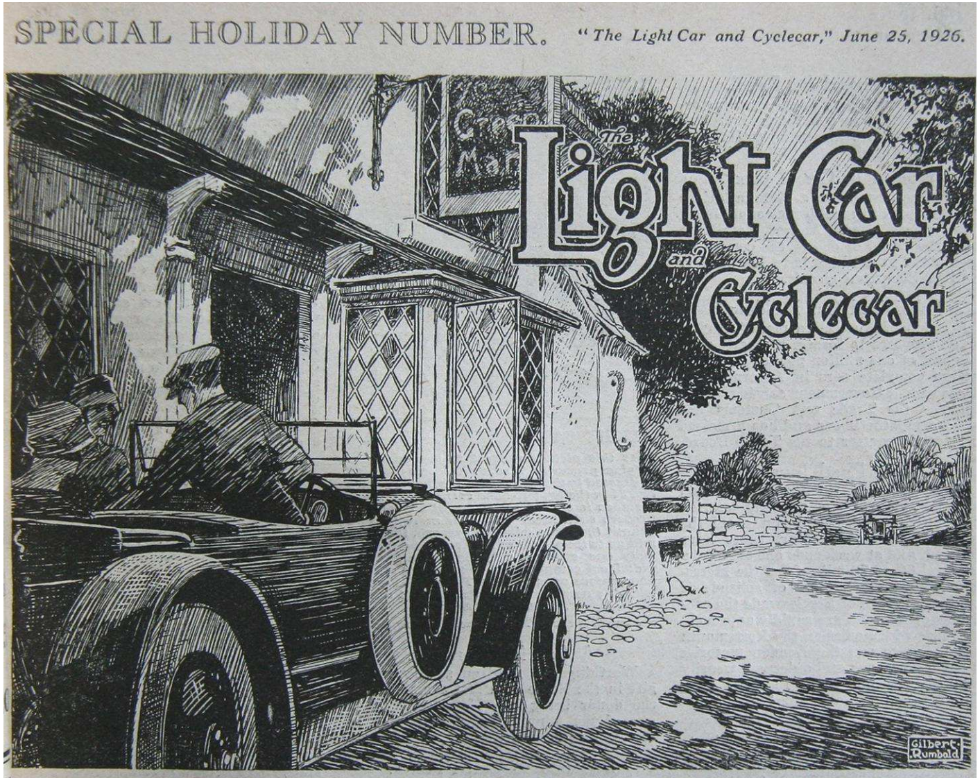
Example of art in the style of Frank Patterson – The light Car and Cyclecar June 1926