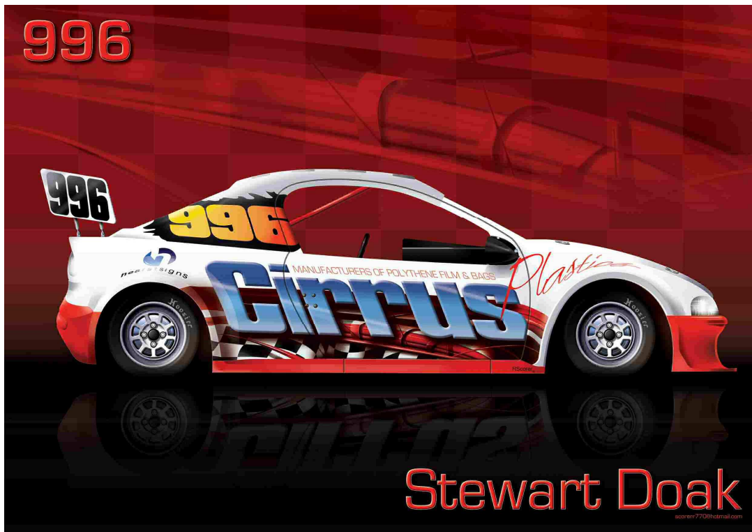
Computer generated artwork for stockcar bodywork

images of the drivers and cars of the time ranging from banger racing to National Hot Rods. His work was also featured as the front cover for the Year Book for 'Short Circuit' magazine in 1987-1988. The stockcar art sales at the circuit ended around 1989 when the great storm blew away the hut. This led to a decision to expand his art into the whole field of