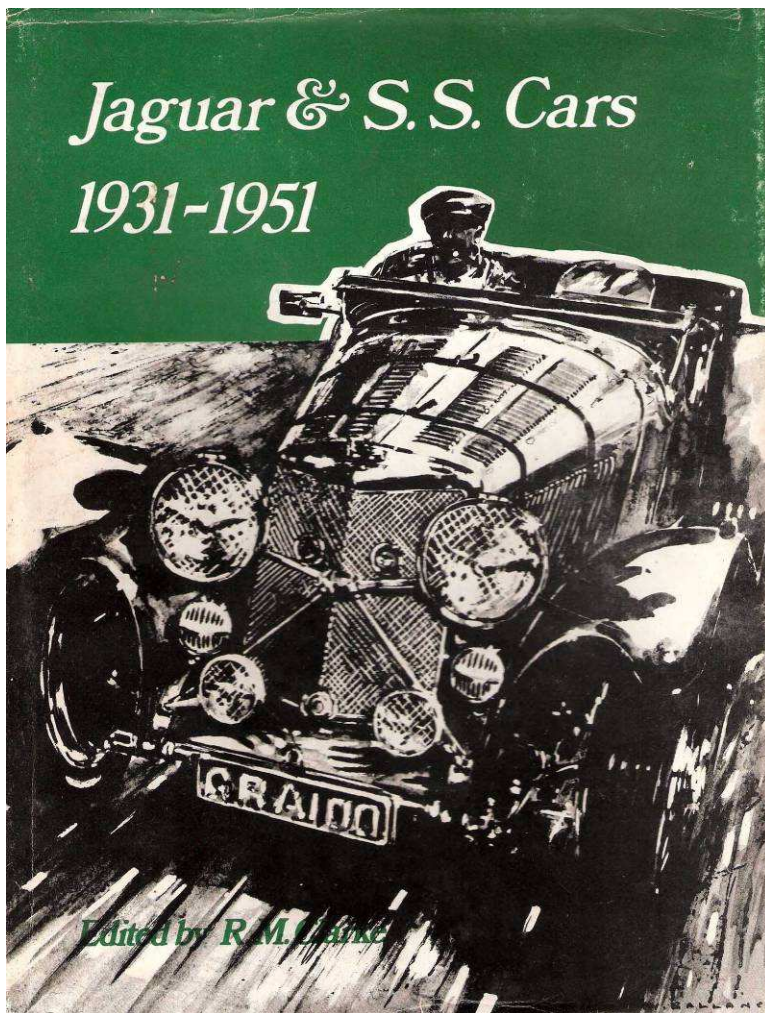
Book cover design for Brooklands Books