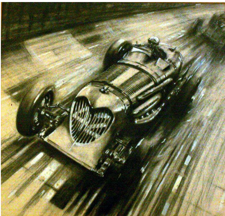
Napier Railton at Brooklands