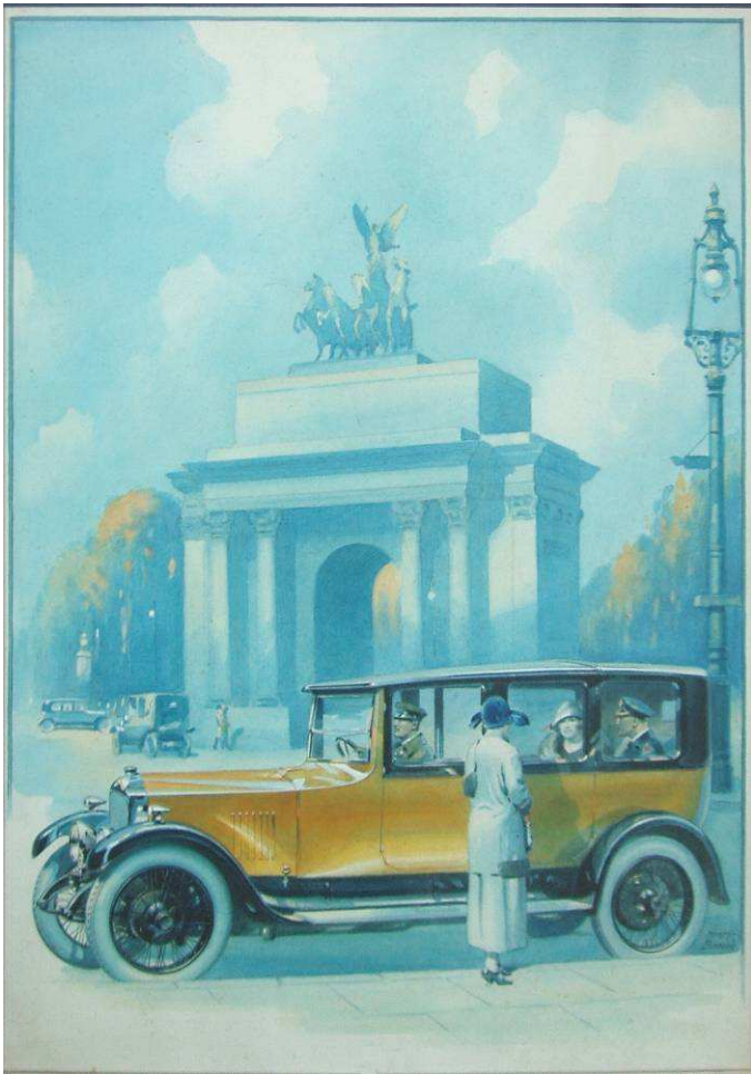
Original artwork for Vauxhall Cars advertising.