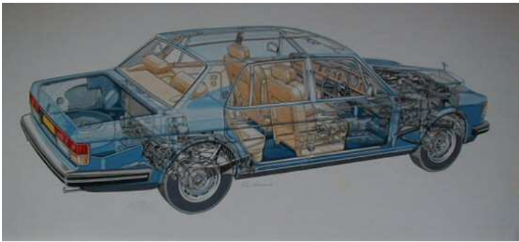
Rolls-Royce Silver Spirit

Technical illustrator for The Autocar magazine produced many illustrations and cutaways in the 1950-1970's. Majority were black and white pen and ink with monotone wash but occasionally full colour was used.