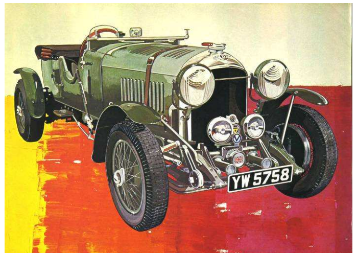
Bentley artwork for Car magazine