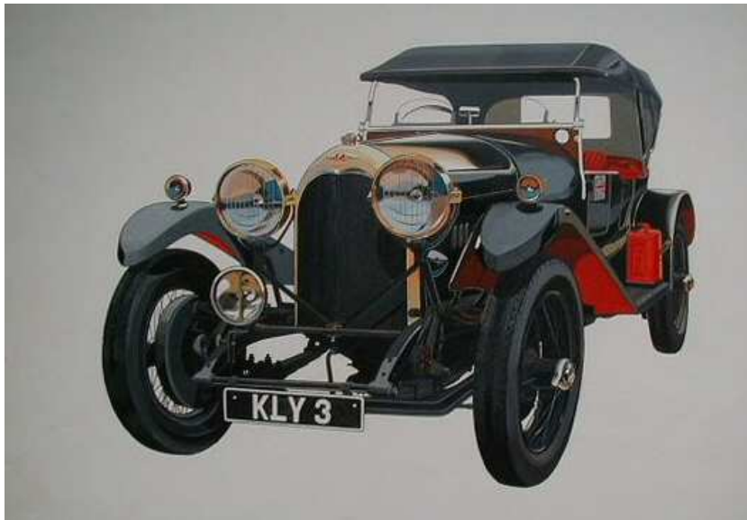
Gouache painting of the Bentley