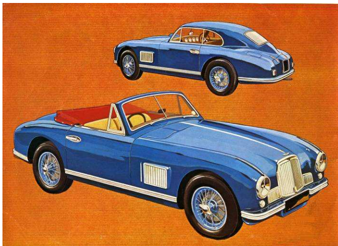
Aston Martin DB2-4 art for The Autocar