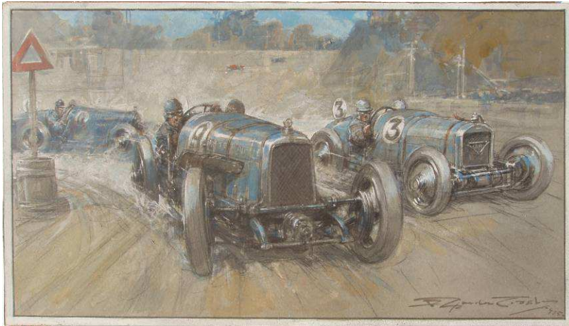
1925 Brooklands 200 Mile Race

These folders were entitled 'The Endless Quest for Speed' and 'meteors of Road and track'.