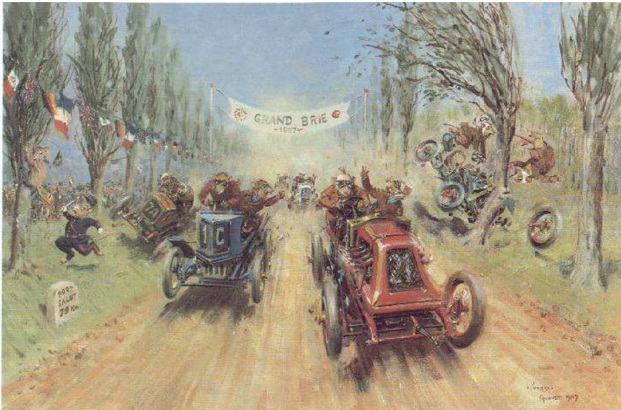
The French Grand Brie

In addition to the Rootes and Dunlop calendars he also did work for road safety calendars. Further industrial commissions came from other motor industry clients for advertising material and sales brochures such as diverse as Alvis, Ford and Armstrong Siddeley.