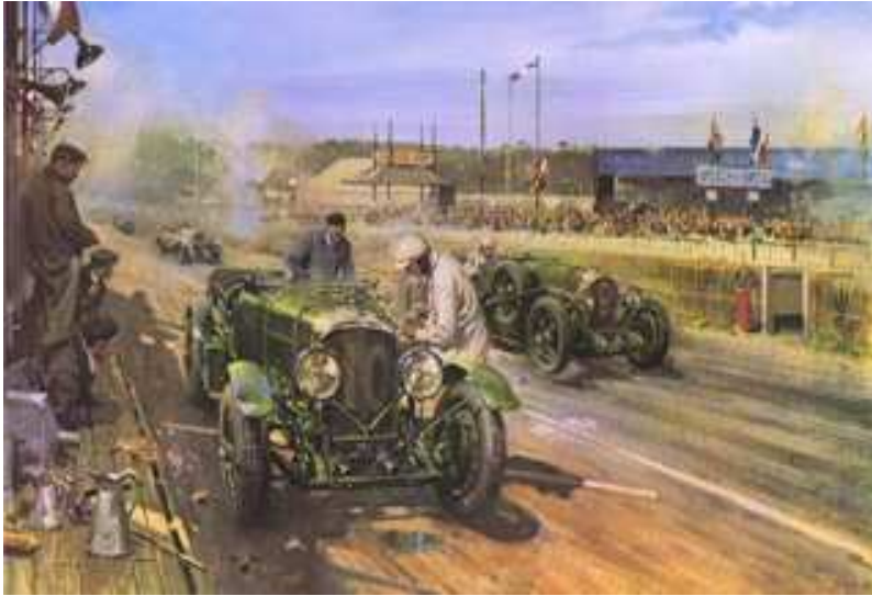
Bentleys at Le Mans 1929

Terence Cuneo's two paintings of the 1929 Le Mans Bentley pit stop and the Blue train racing against Woolf Barnato's Gurney Nutting Speed Six