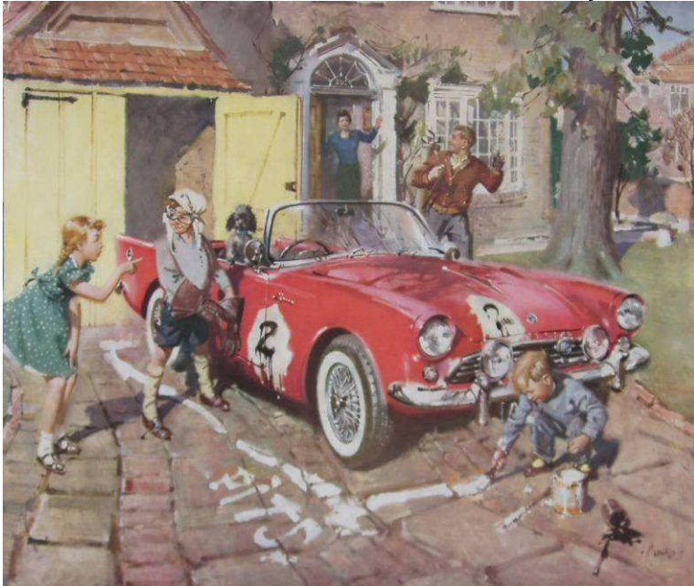
Dunlop calendar artwork with Sunbeam Alpine

came a sequence of cars such as Morris Minor, various AC's, Bentley, Bristol 406, Bristol 408, and finally Bristol 411.