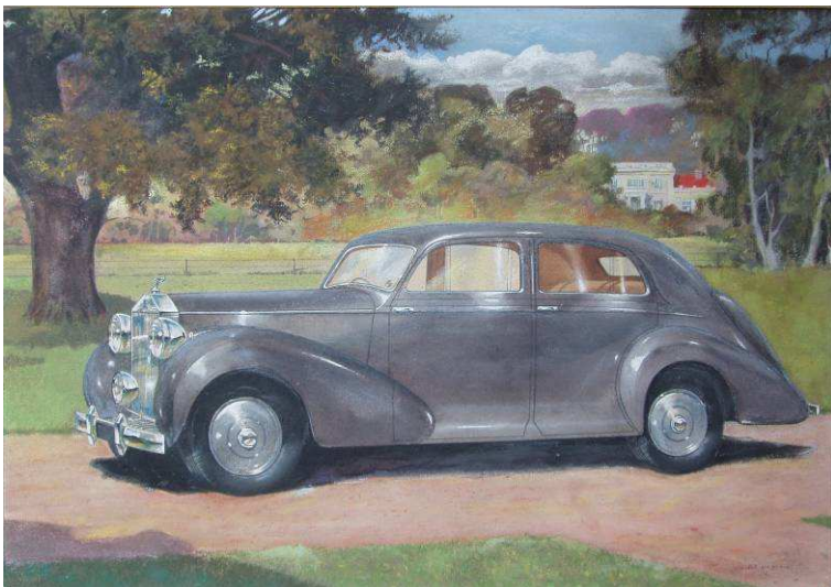
Gouache painting of Rolls-Royce Saloon

Illustrated front cover of The Boy's Book of Motor Racing by H G Castle Guildford Press 1955