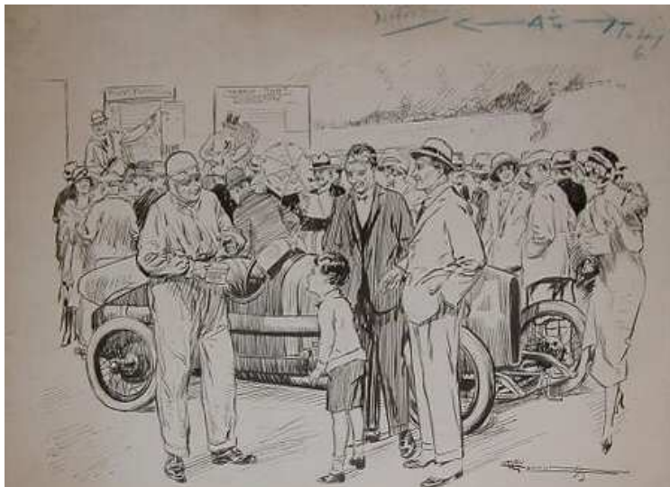
Teddy "I say sir! My uncle has put a shilling each way on you in the next race, you won't let me down will you?" dated 1922