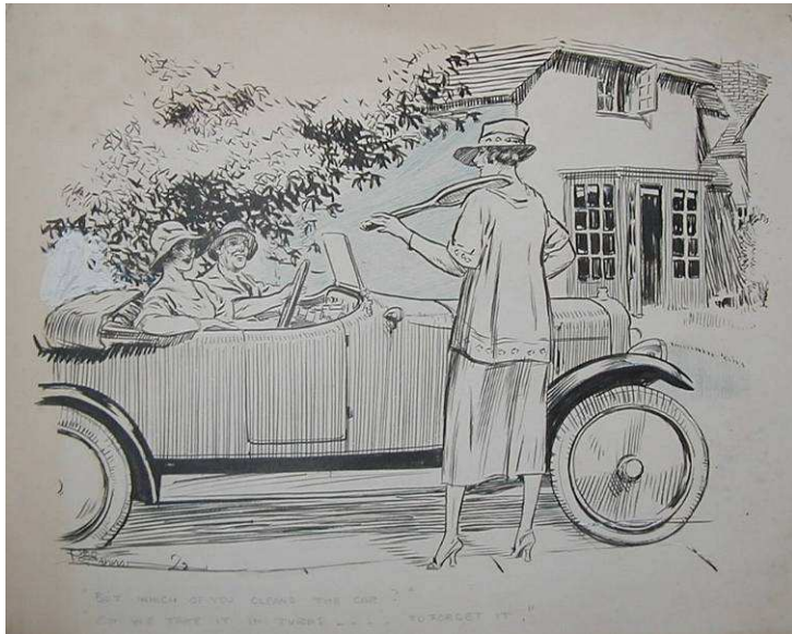
'But which of you cleans the car? Oh we take it in turns ---- to forget it!' dated 1922