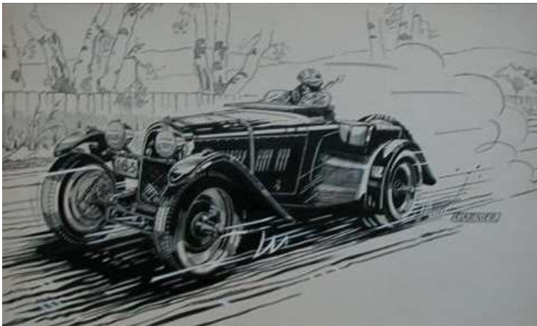
1½ Litre HRG at speed