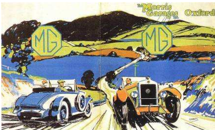
MG 14/40 Sales Brochure circa 1927