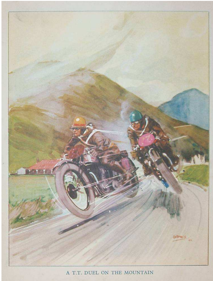
Boys Book of Motor Cycles 1928

political cartoonist creating a popular series called 'All My Own Work'. In 1927/1928 he provided a lot of the illustrations for the 'Boys Book of Motor Cycles' published by Iliffe in 1928. The illustrations include some colour work. He worked for The Star until 1952 when he resigned and moved to Ibiza to paint.