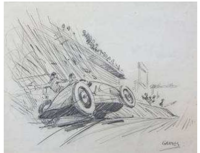
Sketch of an incident at Brooklands