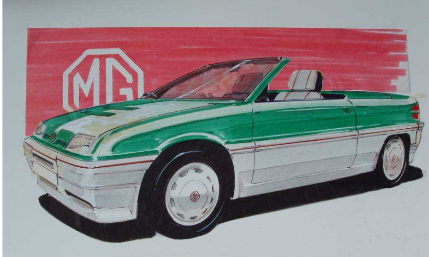
Styling drawing of MG used for front cover of The Motor 19 th January 1984

Brian Hatton was supreme at cutaways having the ability to show detail without the work becoming too complicated. He used pen and ink with monotone wash on art board, the cutaways being executed at a fairly large size (30 x 20 inches) and reduced down for publication. Sometimes pencil shading was used or later Letratone. Where colour-wash is employed on the cutaways it is a soft pure colour that really