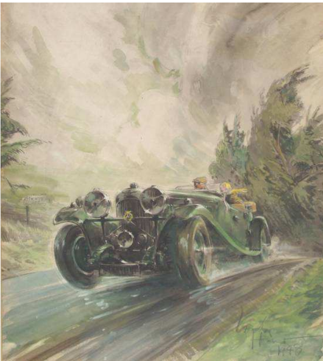
'Joy as she flies' an early work featuring a Lagonda 1948