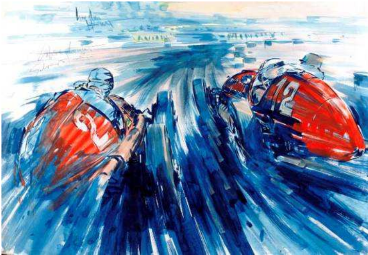
Copse Corner Silverstone