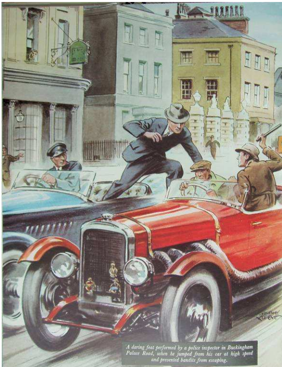
A daring feat performed by a police inspector in Buckingham Palace Road, when he jumped from his car at high speed and prevented bandits from escaping.