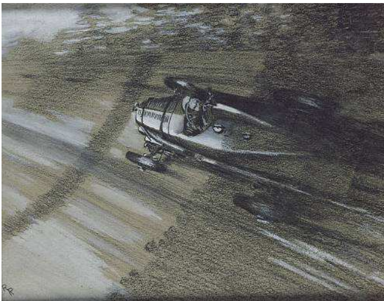
Bentley on the Brooklands Banking