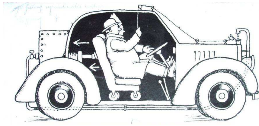
Filling up with water without stopping

known book 'How to be a Motorist' was not published until 1939. This book has been re-published several times and cheap editions are available. Fortunately the original artwork for this book survives and