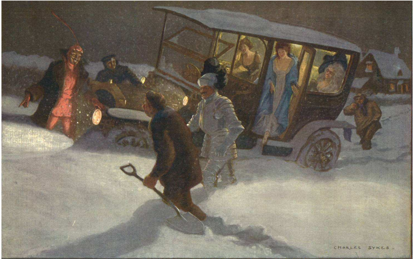
Returning Home From a Christmas Fancy Dress Ball (Consternation of Hodge on being confronted with a vision of his satanic majesty). From The Car – Illustrated magazine 18 th December 1907.