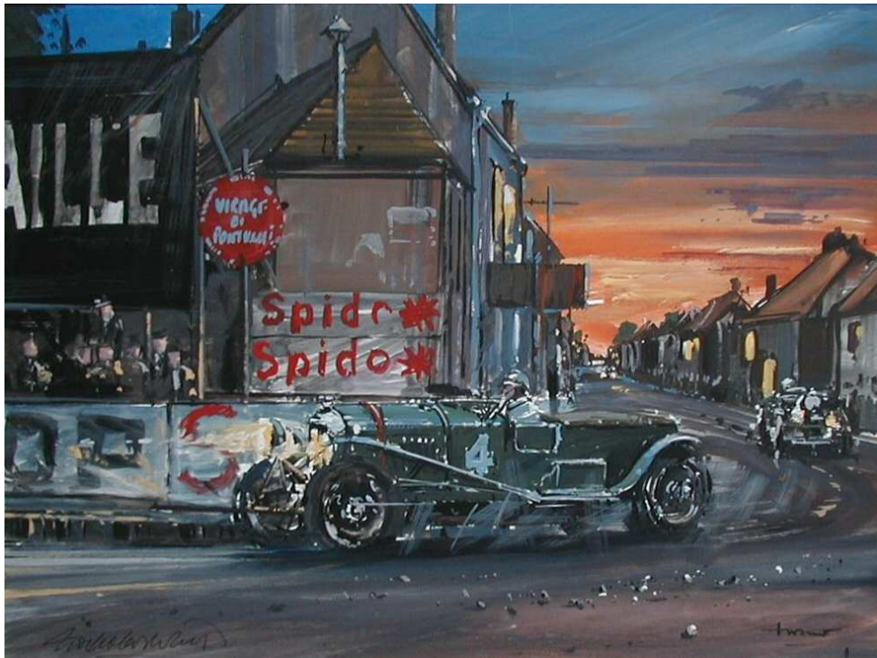
Colour rough for painting of Bentleys at Le Mans

Well known contemporary motor racing artist and producer of prints. Excellent work capturing the speed and colour of the sport. Works to a larger size with acrylics but also colour roughs and pencil sketches. Pencil sketches were prepared for Naquins' book Monaco GP. Only a few were used in the results summary but the archive came on