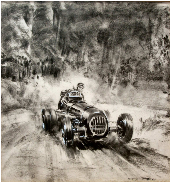
Alta at Prescott Hill Climb circa 1948

completed some notable Lucas paintings of English landmarks and villages in the glare of car headlights). Motoring paintings were also used by Country Life for some of their front covers. During this time he also worked for The Motor on assignments covering such events as Le Mans and the Monte Carlo Rally. For The Motor he would normally produce charcoal or pencil sketches of the events. For the colour work he would often produce 'roughs' for approval before painting the final work. These part-finished roughs give his work an impressionist feel plus they are in bright pure colours.