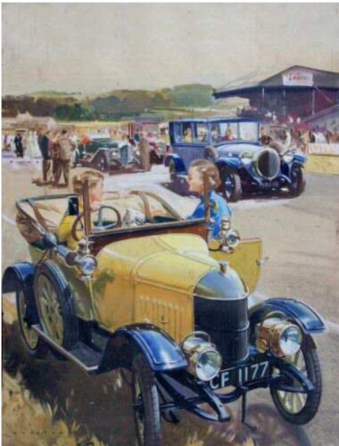
Veteran cars at Goodwood with Wootton's Bullnose Morris in the foreground